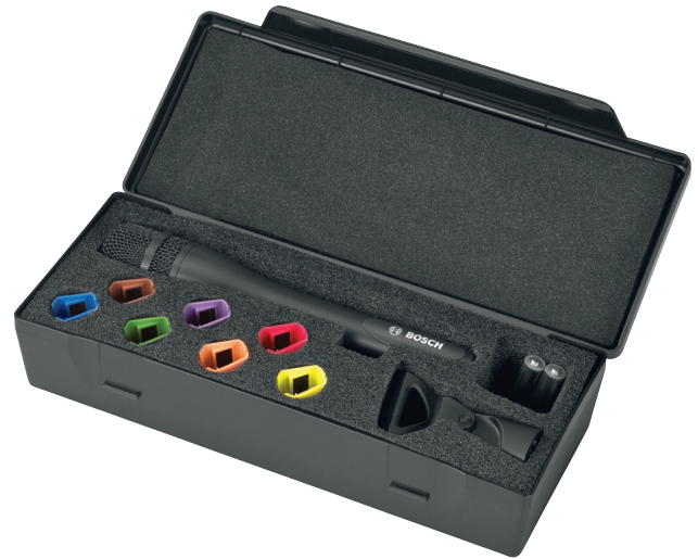
Protective case with wireless, handheld microphone and accessories