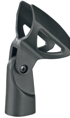
Detail of microphone holder