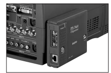
PJ-Net Organizer POA-PN40 (option)

These projectors can be connected to a computer network via the PJ-Net Organizer (POA-PN40, sold separately) for management and control capabilities. Projectors located in several different locations can be controlled from a single computer using your normal web browser - there is no need for any special software.